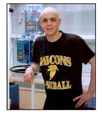
"The best gift you can get is to give a gift to another person."

Like us on Facebook to stay up-to-date on the latest news and activities!